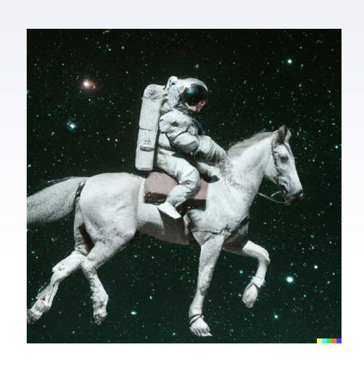
DALL-E 2: An astronaut riding a horse in photorealistic style.